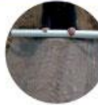
For Soil Solarization