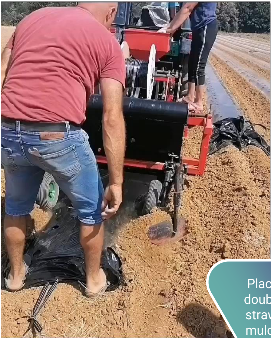
Placing of double-row strawberry mulch film