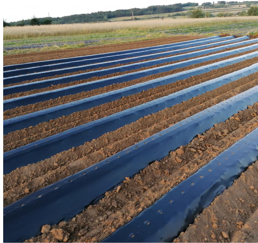
40 microns thick