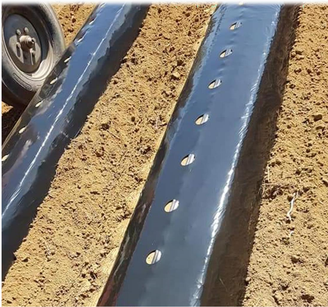
30 microns thick