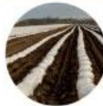
For low tunnels