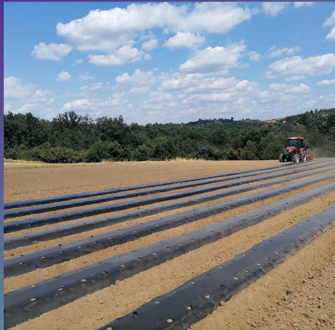
30 microns thick, double row, hole spacing 30x30