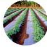
Black / silver